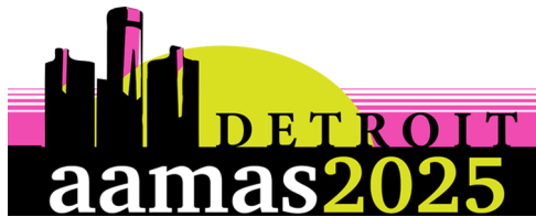
Figure 1: The logo of AAMAS 2025

Use the ‘figure’ environment for figures. If your figure contains third-party material, make sure to clearly identify it as such. Every figure should include a caption, and this caption should be placed below the figure itself, as shown here for Figure 1.